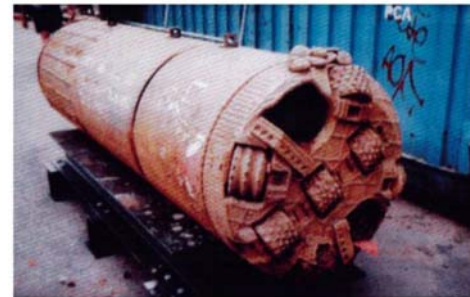
The shield after excavating cobble stones