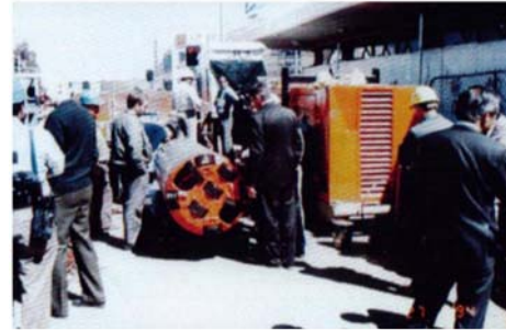
Field demonstration on 600mm dia shield

Presented a paper titled " Slurry Shield tunnelling in Siltstone and Cobble Stones:- Australian Experience by Bala K Balasubramaniam & Charles Di Francesco, at the International No-Dig 96 Conference held in New Orleans, USA in April 1996.