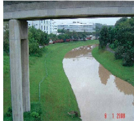
Pipe Jacking location