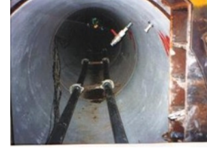
Jacking is in progress

TTI Consulting Engineers, Sydney 32 Newington Technology Park 8 Avenue of Americas Newington NSW 2127 Sydney, Australia Tel: 61 2 96483644 Fax: 61 2 96483944