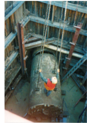
Shield emerges at the pit