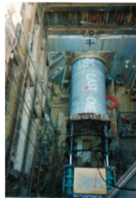
Jacking of last pipe